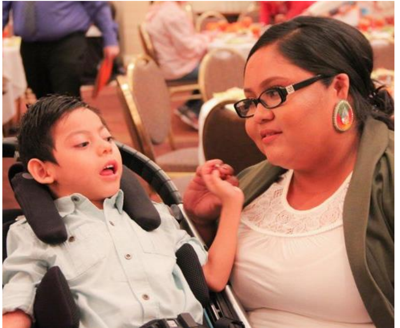
Photo of a boy in a wheelchair interacting with a woman at a conference from EPICS