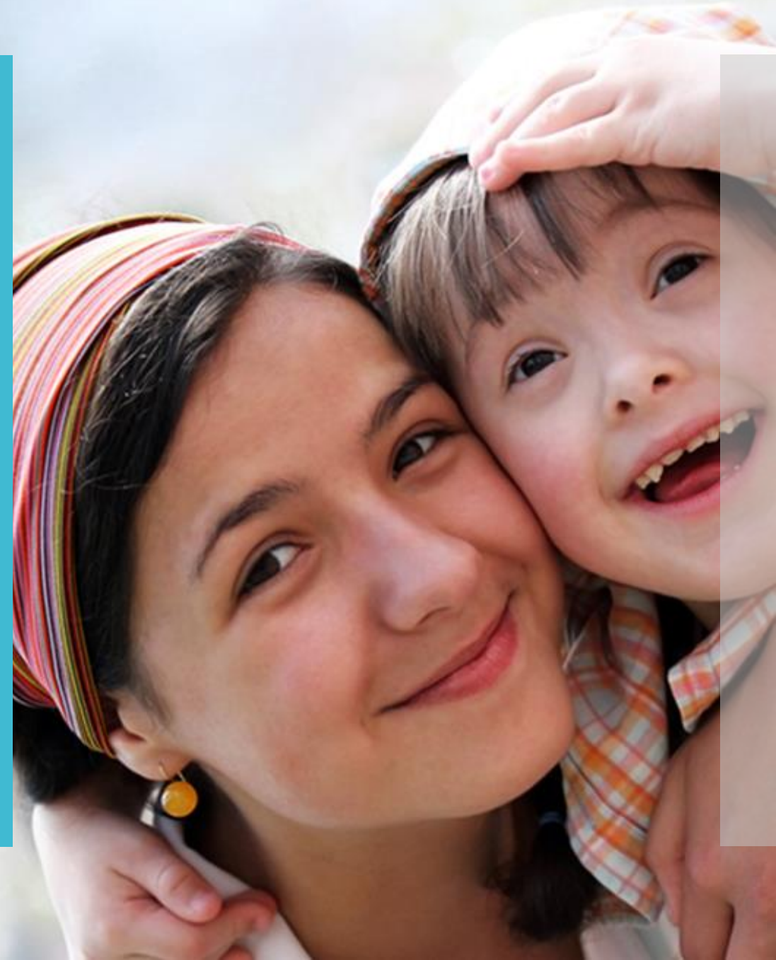
Photo of a smiling woman holding a smiling girl with Down Syndrome

NM DDC prioritizes education because the benefits and consequences of education have ongoing, drastic downstream effects throughout the lives of New Mexicans with I/DD, and major repercussions for our state's resources and economy.