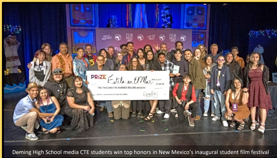
Deming High School media CTE students win top honors in New Mexico's inaugural student film festival