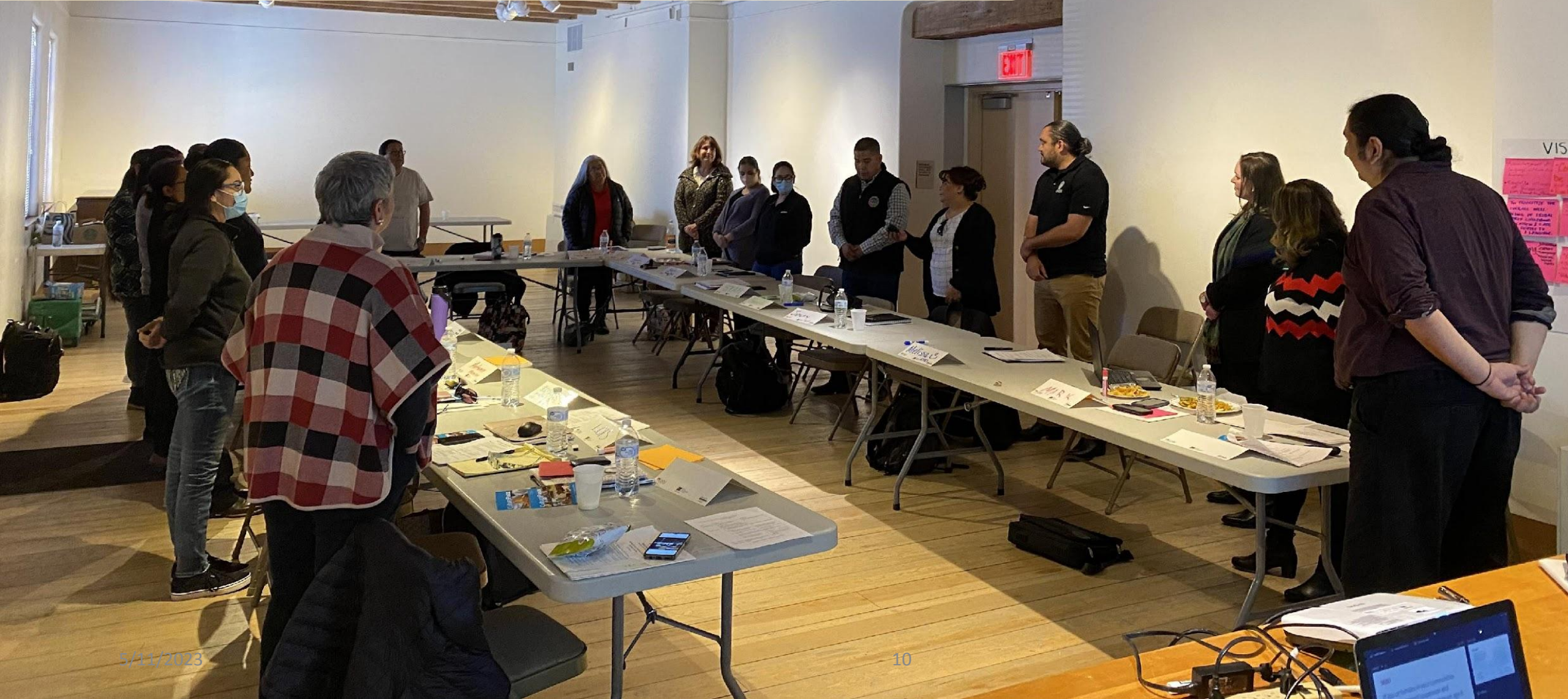
Pictured: Tribal Advisory Coalition work session at New Mexico History Museum, February 2023