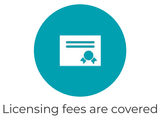
This covers the cost of licensing for Ed. Fellows and mentor teachers

$500 per semester for mentor teachers This is to cover the cost of mentoring Ed. Fellows