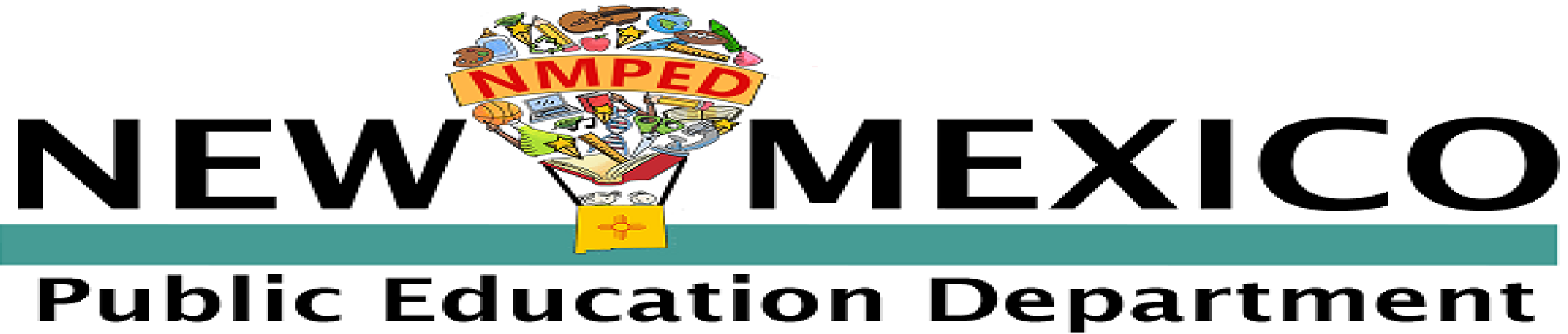
EXHIBIT B (24154 - Carryover FY19-20, FY20-21, FY21-22, & Final FY22-23)