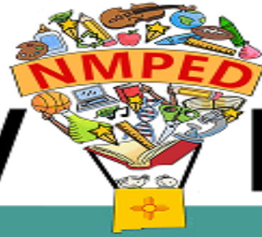
EXHIBIT A (24109 - PLANNING FY24-25)