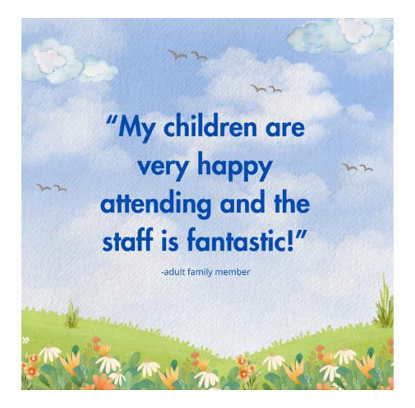
Figure 6: Adult Family Member Quote